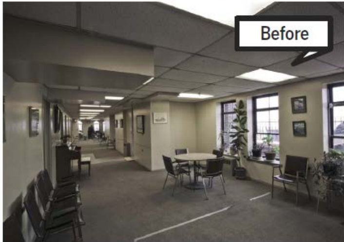
Pierrepont Senior Apartments Brooklyn, NY