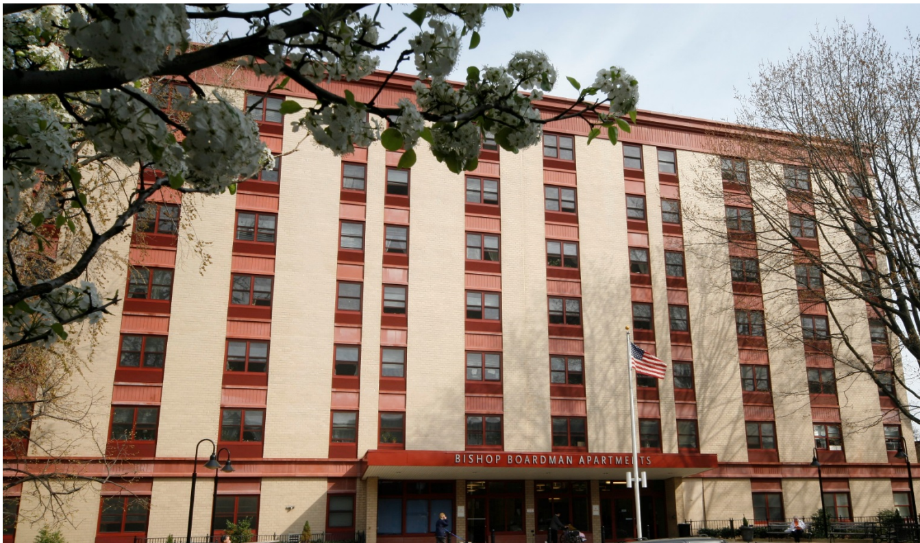
Bishop Boardman Senior Apartments Brooklyn, NY